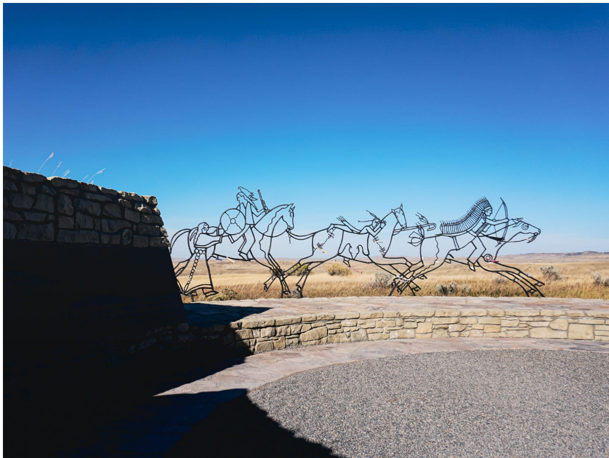
The sculpture of the sister saving her brother that stands at the Battle of the Little Bighorn National Historic Site.