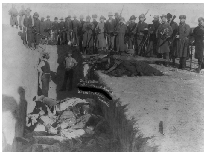
The mass grave at Wounded Knee